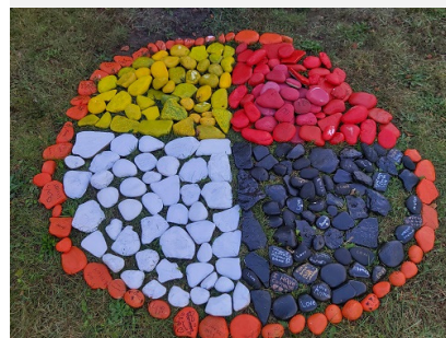
Student created medicine wheel at G.C. Huston Public School